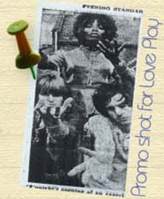
Promo shot for Love Play

It was the time of sexual freedom and revolution and I'd written this play about all night characters, dreamers, no-hopers set in a dive in the West End. It lasted twelve underground performances, it was my brilliant successful failure and it left me feeling letdown, depressed and led me into an alchemical crisis.